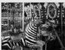
AMUSEMENT PARK TICKET